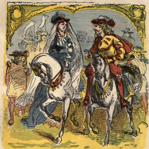
The Prince conducting the beautiful Princess to his father's palace.

accordingly took place ; and the next day, the prince conducted his bride, accompanied by her attendants, in grand state, to his father's palace. The trees which surrounded the palace where the Sleeping Beauty had reposed for one hundred years, were mostly gone, just a few remained ; and triumphal arches had been put up, for the procession to pass under, but who placed them there was a mystery.