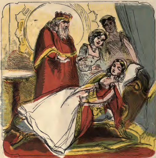
Sleeping Beauty conveyed to her couch after her accident.

able ; and seven fairies, being all that could be found in the country, were invited to be her godmothers ; so that each of them might bestow upon her a gift, as was the custom in those days.