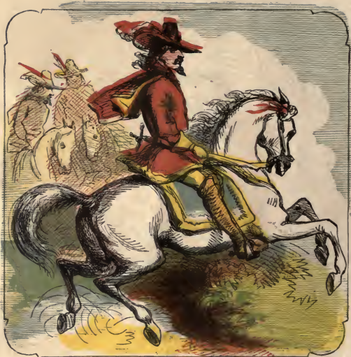
The Prince and his attendants hunting near Sleeping Beauty's Palace.

me even more than he loved himself; and the moment I saw you, I recollected your face."