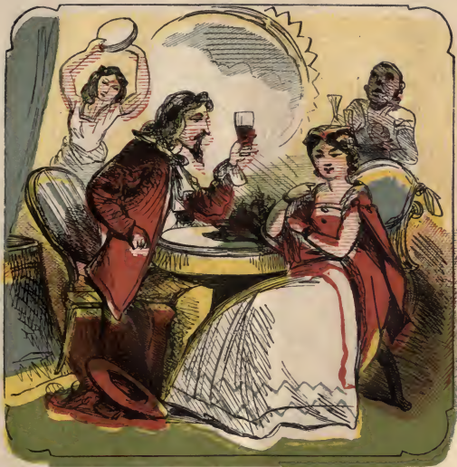
The Princess taking refreshment after her long sleep.

He took her hand, and conducted her to the apartment in which the refreshments were served, and as soon as they were seated at the table, the musicians, who were in readiness with their instruments, began to play some airs ; which, although very old, were nevertheless extremely agreeable. In fact, the prince felt himself so happy, with the old-fashioned appearance of every thing that met his view, whichever way he looked, and which seemed to borrow a charm from the beautiful princess, that he was completely filled with pleasure.