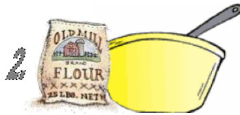
2 mix the ingredients