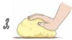
3 knead dough until elastic shape