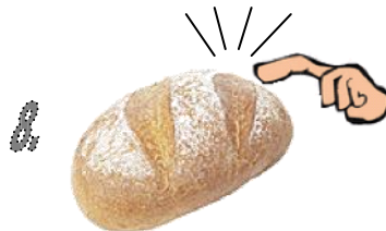
8 tap to check if ready – does it sound hollow?