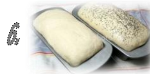
6 allow to rise