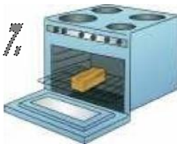
7 bake in oven