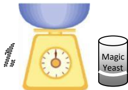
1 weigh the ingredients

Look carefully at the different stages of the process of bread making. Write a report on how bread is made, with the help of the pictures.