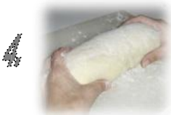
4 roll into